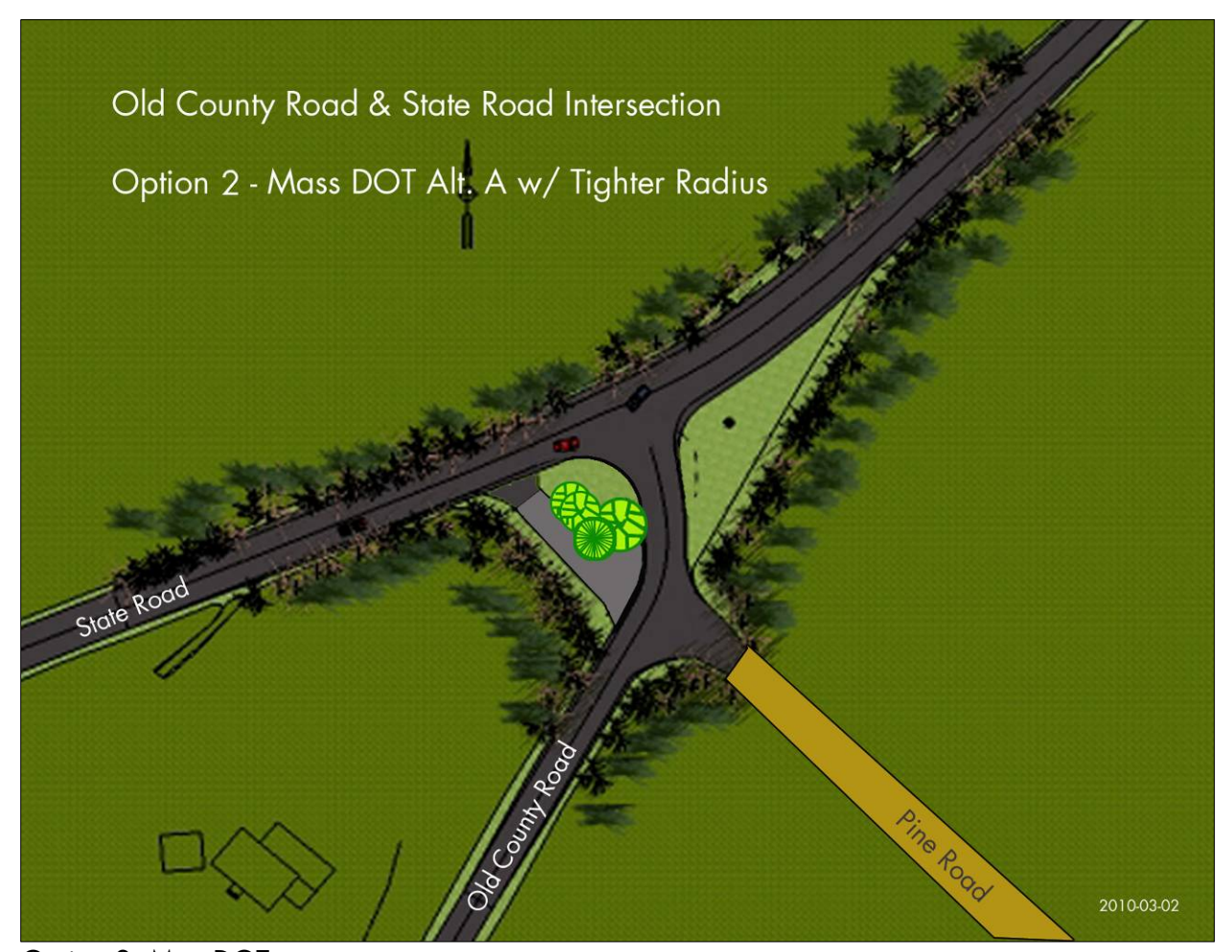
Option 2: MassDOT

Note that this sketch is based on the intersection location proposed by MassDOT, but the dimensional requirements are tighter as explained in the next section.